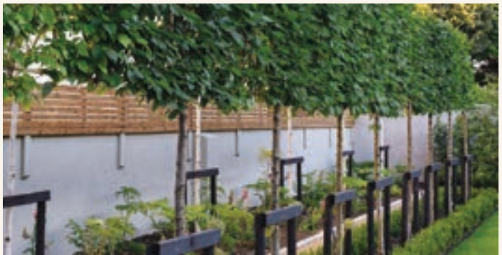
Create space between trees and limb up low branches to reduce the risk of fire spreading

Densely planted privacy screens can create a wall of fuel, making a continuous pathway for fire. Alternating trees with your neighbor can create a very attractive screen—breaking up the line of fuel.